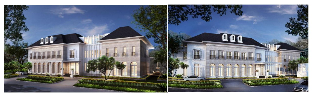
The Widyachandra Residence

Since 2010 Fast Flow and its Licensed Distributor; Siphonic Flow Mandiri (SFM) have been helping home owners in Indonesia articulate and align their needs with dynamic use of space. As of today, Fast Flow Siphonic rainwater drainage systems are installed in eight high-end private residences in Indonesia.