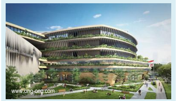
Project title: Bedok Integrated Complex Catchment area : 7,200 sqm