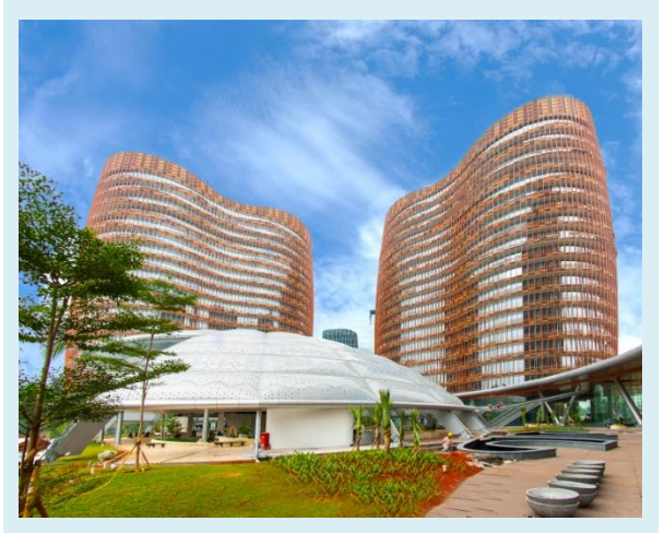
Project title: South Quarter Catchment area: 6,815 sqm