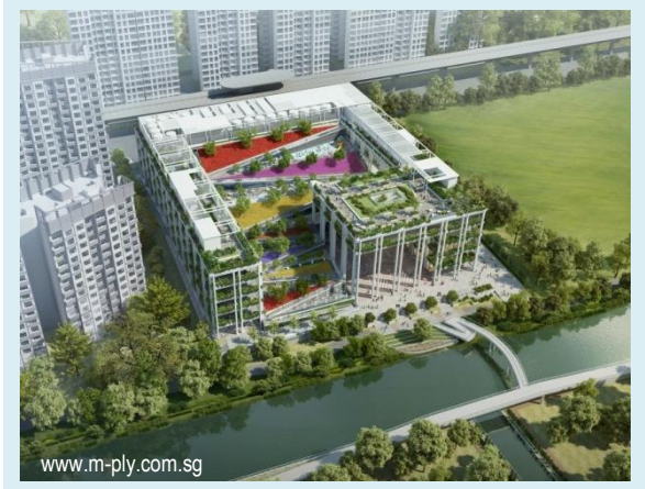
Project title: Oasis Terraces Catchment area: 9,500 sqm